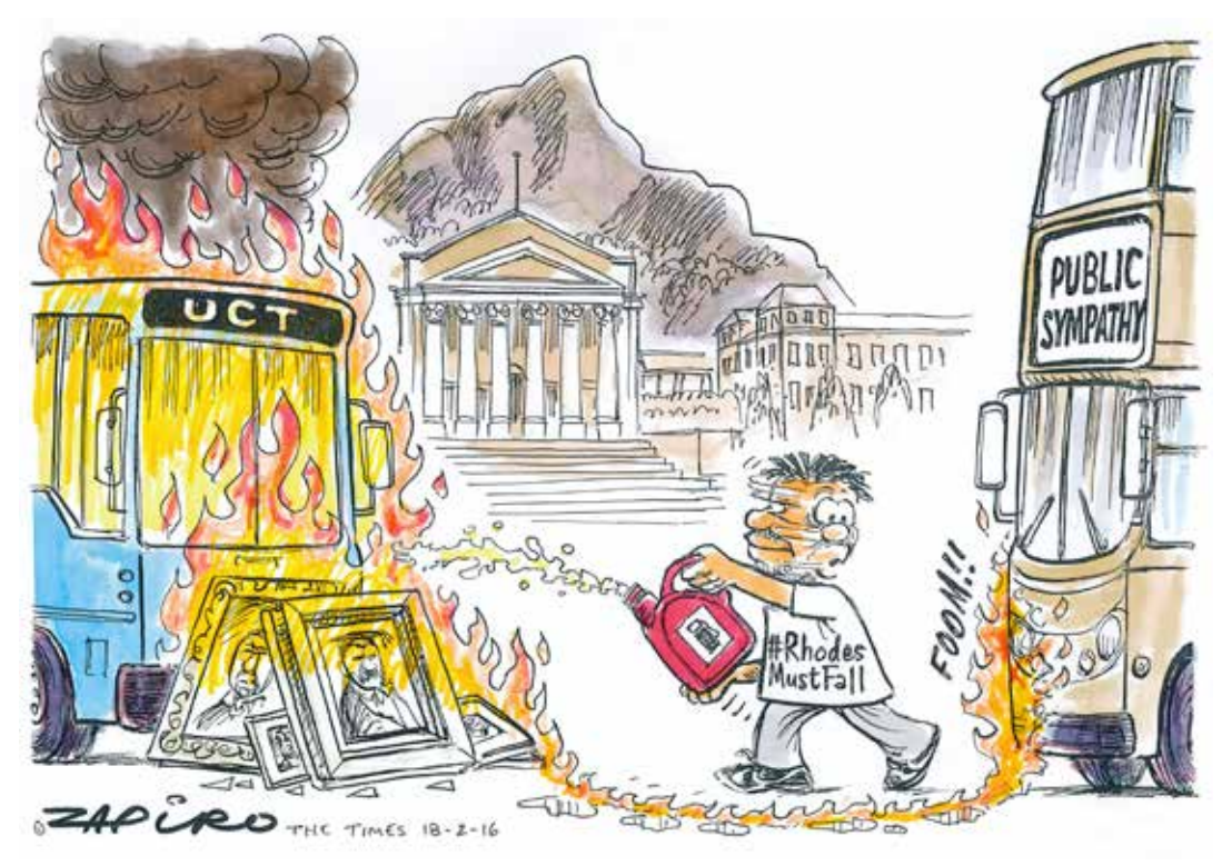
Cartoon by Zapiro, The Times © 2016. Reprinted with permission

During the transition years, The last Town Clerk of the city, noted that certain mayoral portraits had been defaced and he consulted with the museums and art galleries in the city and found homes for the old art works and various relics. These included the British Union Jack that used to flutter defiantly over the City Hall on