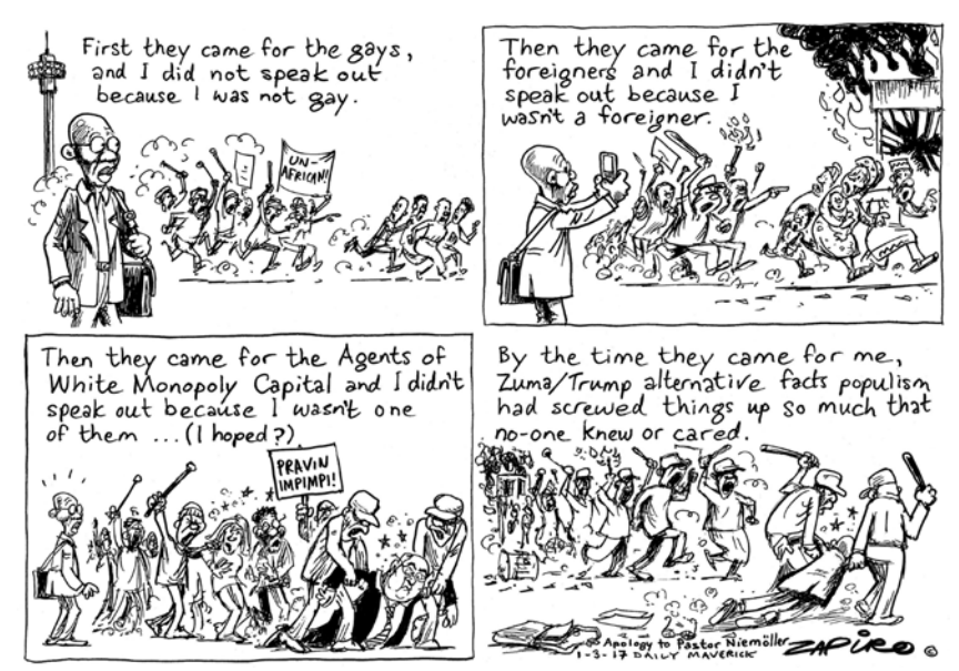
Cartoon by Zapiro, Daily Maverick © 2017. Reprinted with permission

no theoretical and methodological basis of existence and hence they are theoretical bubbles. These theoretical bubbles are fed to the citizen via the media (with various ideological interests) for the public to consume. To illustrate my point, the statement by the current minister of Water Affairs who was quoted as saying "when the rand falls we will pick it up..." is one such glaring example. Furthermore, concepts like Radical Economic Transformation, White Monopoly Capital and sometimes a very generic interpretation of decolonisation that clearly are used by these populists for their own interests and not for the advancement of society.